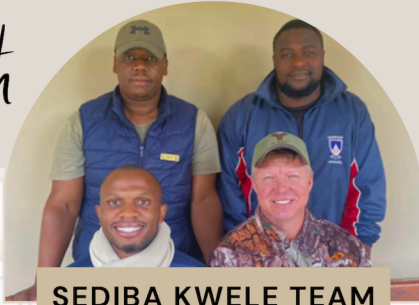
SEDIBA KWELE TEAM